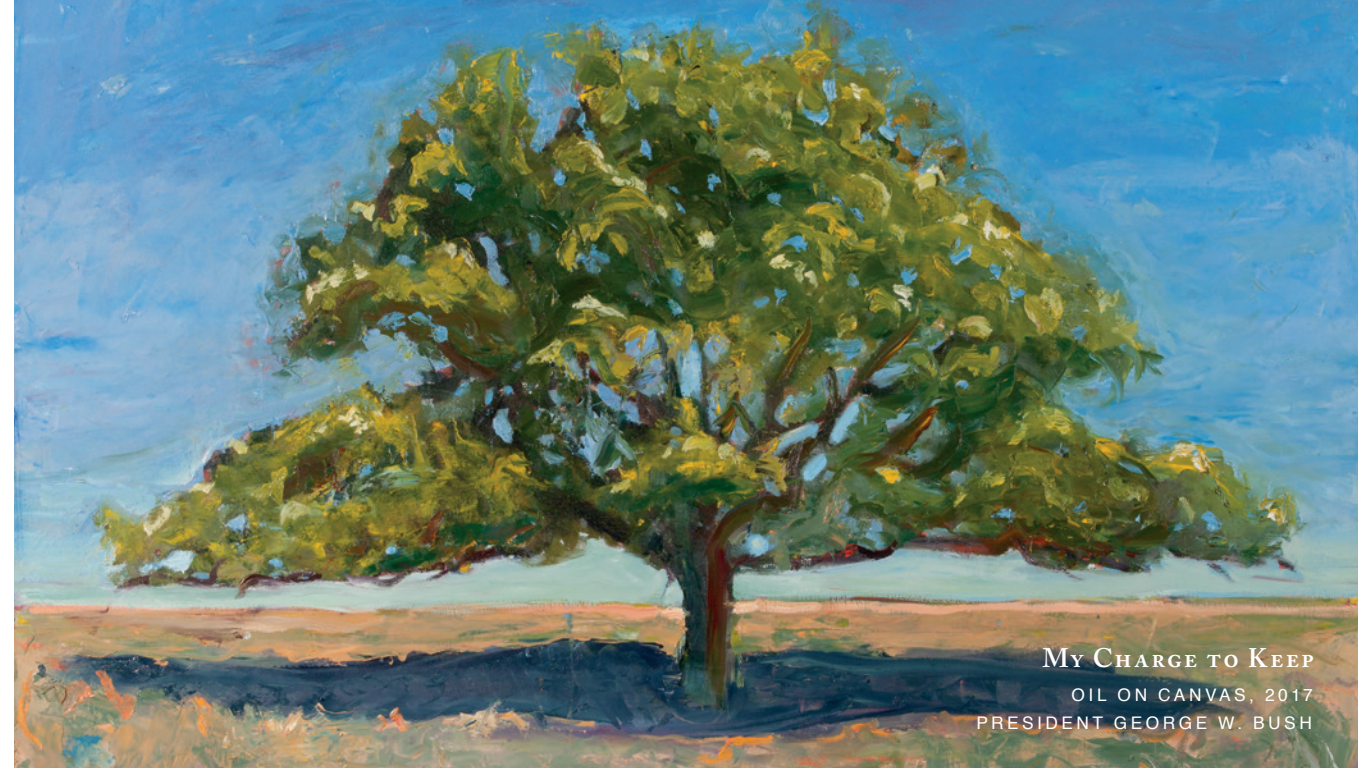
MY CHARGE TO KEEP OIL ON CANVAS, 2017 PRESIDENT GEORGE W. BUSH

As President Bush once wrote, referencing the hymn that inspired the campaign name,